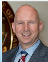
Jack Markell Governor, State of Delaware